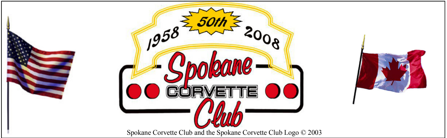
Spokane Corvette Club and the Spokane Corvette Club Logo © 2003