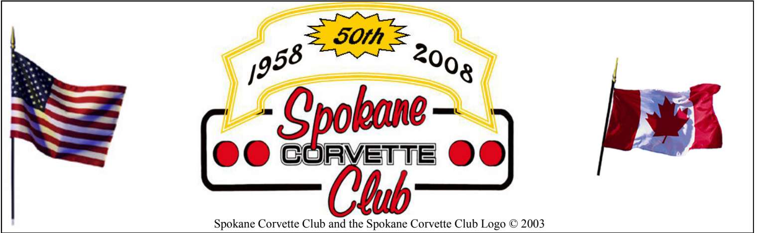
Spokane Corvette Club and the Spokane Corvette Club Logo © 2003