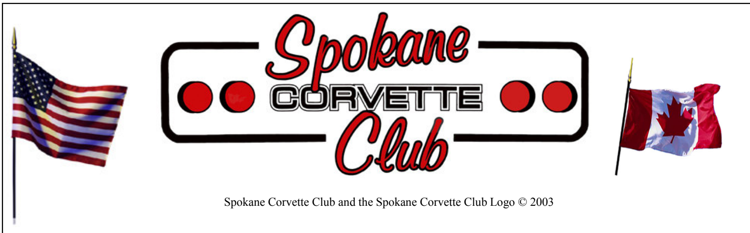
Spokane Corvette Club and the Spokane Corvette Club Logo © 2003