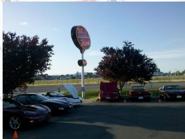
Dinner run to Hot Rod Cafe