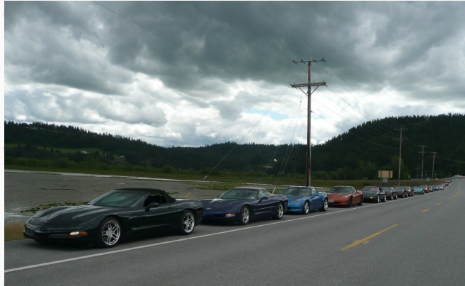
Dice run around lake CdA